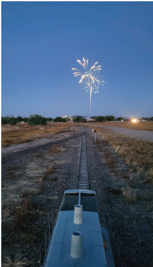
Photos from the Memorial Day Run, 5/28/23