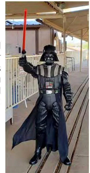
Lord Vader bids you good eve!