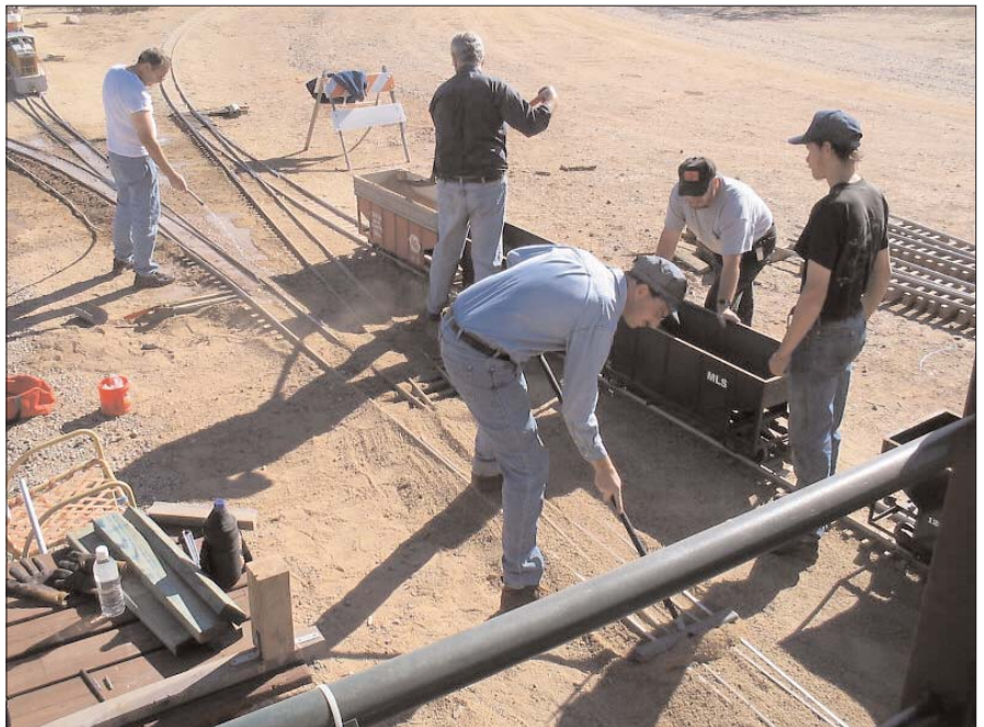
Here are additional photos of the replacement of switches at Adobe Junction.